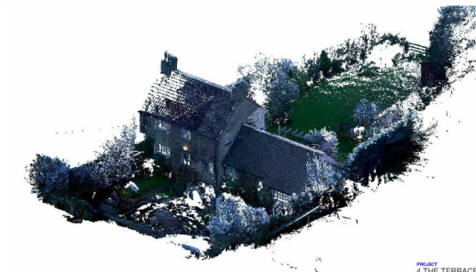
ACCURATE LEVELS TAKEN FROM LASER SCAN SURVEY (IMAGE OF SCAN ABOVE)

PROJECT 4 THE TERRACE OSWALDKIRK TITLE SITE SECTIONS SCALE 1:200 @ A1 DATE 14/09/21 DRAWN KJ REVIEWED PH DRAWING NO. PR_P112 REVISION FILE PATH C:\projects\4 the terrace\4 the terrace.dwg User: terracedesign\j.k